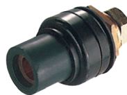
Built-in welding coupling high voltage with protective collar