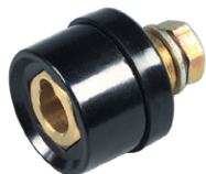
Built-in welding coupling