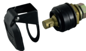
High voltage welding plug with cover