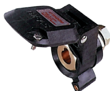
Built-in welding coupling with cover