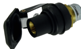
High voltage welding coupling with cover