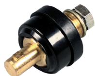
Built-in welding plug