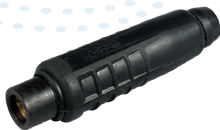
High voltage welding coupling with protective collar