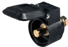
Built-in plugs coupling with cover