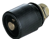
High voltage welding plug with protective collar