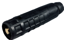
Built-in welding plug high voltage with protective collar