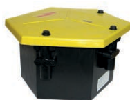
Point heating connection box Type 6400