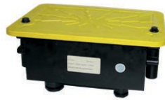
Signal connection box Type 2518