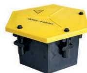
Point heating sensor box Type 6400