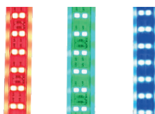
Light colour variants