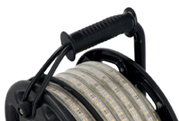
Handle with integrated elastic band to lock the cable reel

The LED stripe is supplied ready for connection with 25 meters on a cable reel or 5 resp. 10 meters on cable unit. The mains connection is made using the supplied connection cable. The FlexLED light stripe can be connected quickly and easily and thus be extended to a maximum length of 100 m.